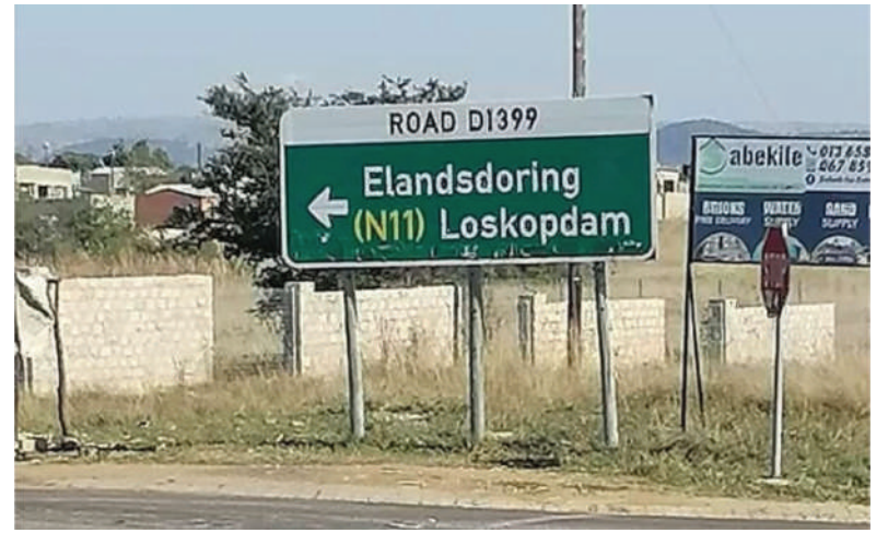
The EFF in Sekhukhune has lambasted the Elias Motsoaledi Municipality handing over pensioners' debts to collectors at Elandsdoring without proper consultation. The party is also citing poor service delivery in the township.