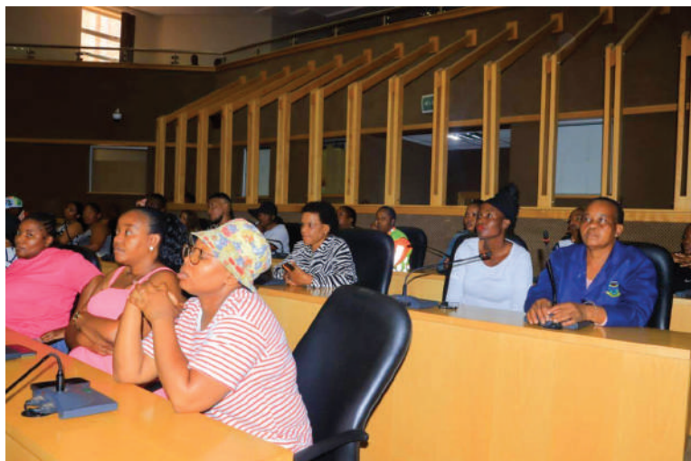
The FTLM's employees.