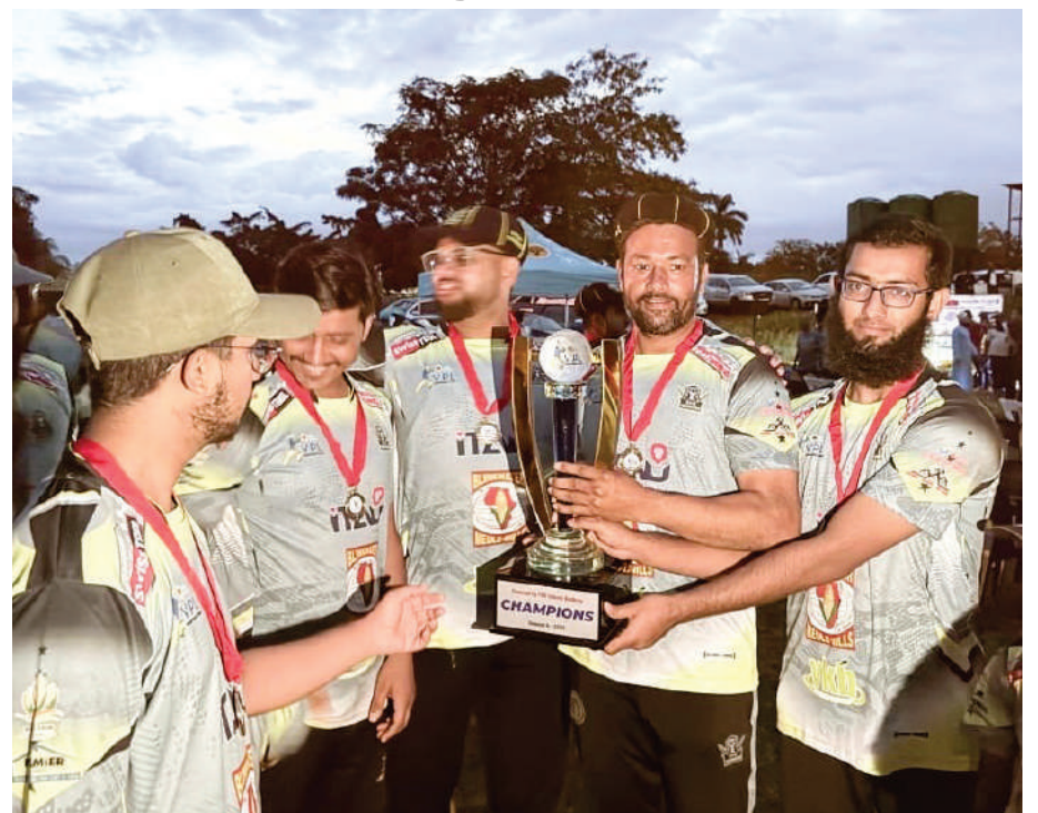
TCC players helped Khota Warriors to win VPL.