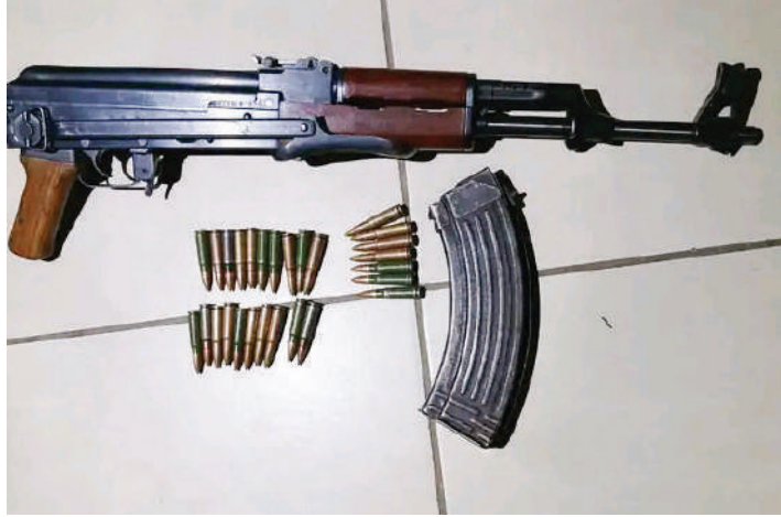
A 34-year-old male suspect is set to appear again before the Nebo Magistrate's Court for possession of prohibited firearms including a high caliber AK-47 rifle.

PHOKWANE - A 34-year-old male suspect appeared before the Nebo Magistrate's Court recently, facing charges of possession of prohibited firearms.