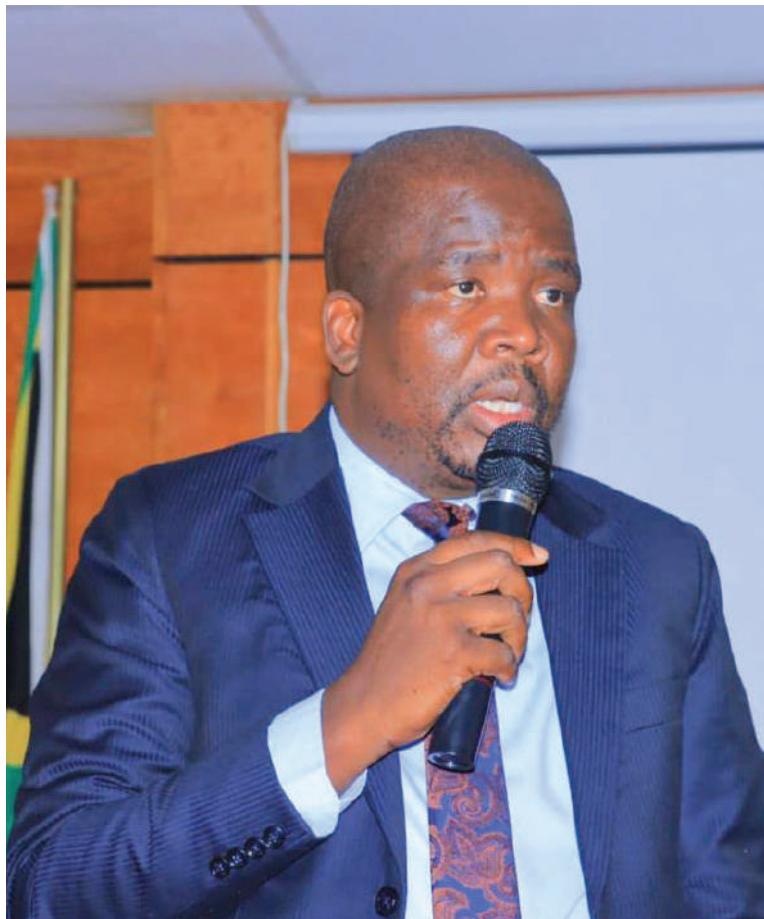
FTLM's mayor Eddie Maila.